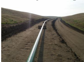
Pipeline Inspection Services