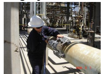
Vessel Corrosion Scanning Services