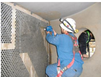
Tube Inspection Services

API 510 / 653 / 570 Inspections ( Pictured ) AB 1960 Consulting & Inspection Services Conventional NDT: UT, UTSW, MT, PT, VT Tubular Inspections ( Pictured ) NACE Certified Coatings Inspection ( Pictured ) EMAT Pipeline/Vessel Inspection ( Pictured ) Corrosion Under Insulation Inspection Pipeline Soil to Air Inspection ( Pictured ) ASME Code Weld Inspections Ultrasonic Pipeline / Vessel Inspection ( Pictured ) Turnaround / Outage API and NDT Inspections Services On-Stream Real Time Corrosion Monitoring Line Locating Services AutoCad Drafting Services Project Management (Tank & Pipeline Repair / Construction)