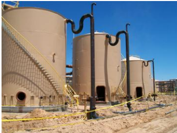
API 653 Inspections

Let us talk with you about your future Mechanical Integrity needs.