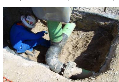
Soil to Air Corrosion Inspection